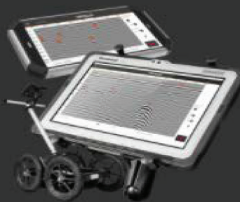
MALÀ CONTROLLER APP

GPR Acquisition software to help you go as fast as possible from data collection to delivering results