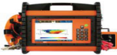
ABEM TERRAMETER LS 2