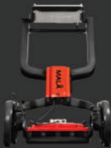
MALÀ EASY LOCATOR PRO

The professional's choice for utility mapping, with added post-processing and positioning features