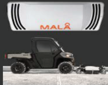
MALÀ MIRA HDR

3D GPR array for mapping large areas to locate buried objects and artifacts. Used in utility locating, road surveys and bridge deck scanning