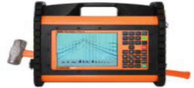
ABEM TERRALOC PRO 2