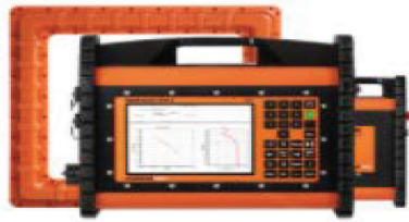
ABEM WALKTEM 2