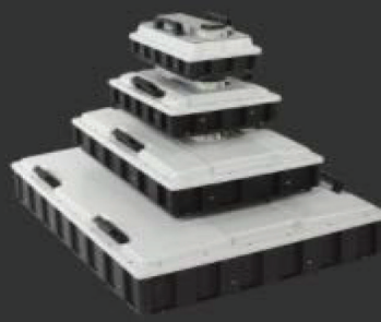
MALÀ GROUND EXPLORER

A flexible GPR solution with a wide range of antenna options and measuring devices, offering exceptional range and resolution