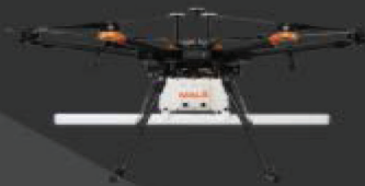
MALÀ GED DRONE 80

Airborne GPR solution for efficient field work, designed specifically for data collection in remote, hazardous and in-accessible areas